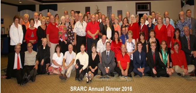
SRARC Annual Dinner 2016

2016 was a great year for SRARC ending with the Annual Banquet at The Club at Treasure Island. We had 74 members present with great food and fun.